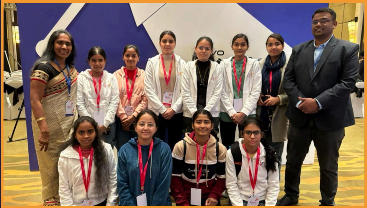
In-person event at Vivo Office, New Delhi